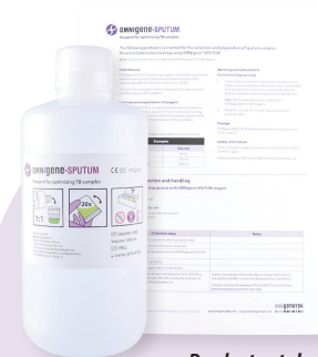
Product catalog #: OM-SPD-250 and OM-SPD-1000

OMNIgene<sup>®</sup>•SPUTUM is a non-toxic and highly stable reagent that liquefies and decontaminates sputum samples at the point-of-collection or in the lab. MTb viability is maintained for 8 days at ambient temperatures ranging from 4°C to 40°C. Optimized samples are compatible with all routine TB tests, enable cost-effective sample transport, and simplify laboratory workflows while eliminating the need for NaOH/NALC.